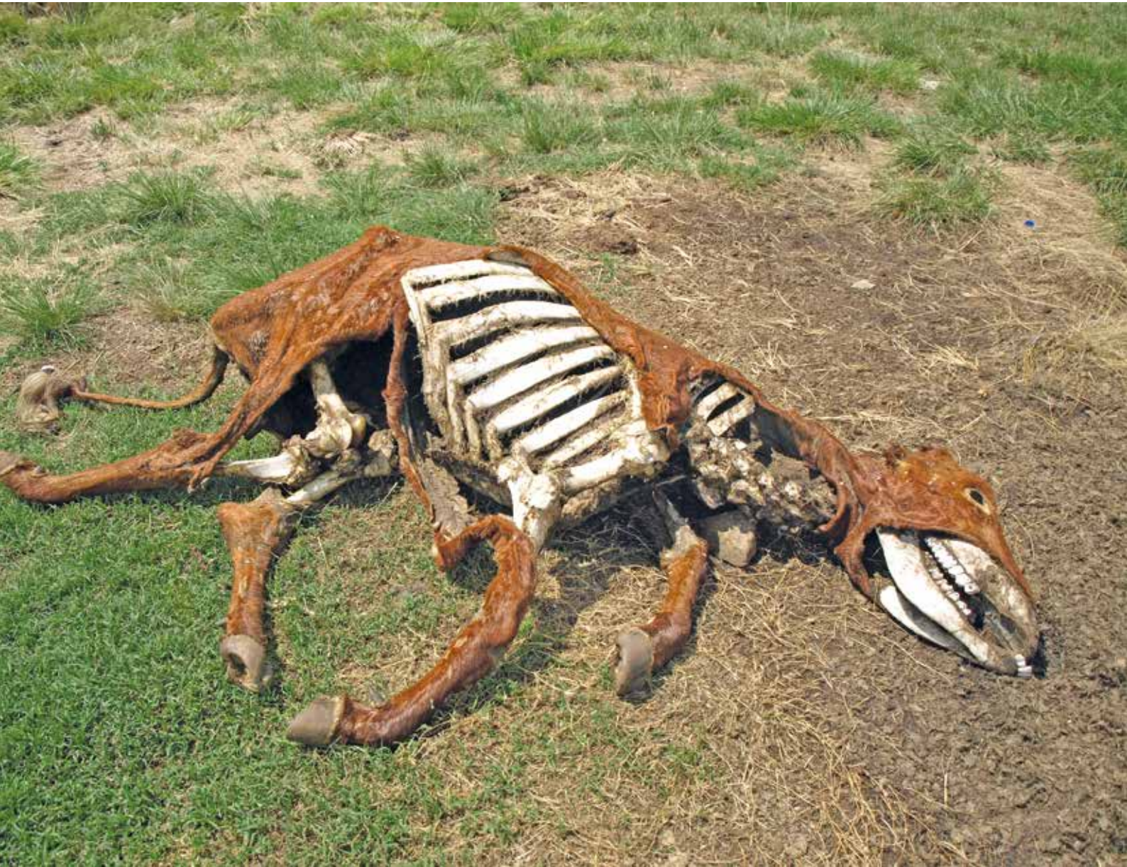
For nature to become self-regulating, all processes in the ecosystem must be complete, including the decay of dead animals.