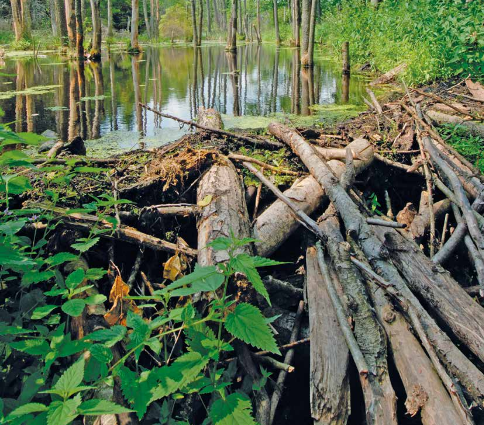
Released beavers create dynamic developments in nature by building small dams. In contrast to other rewilding projects in Denmark, the beavers are not fenced, so when the populations grow the animals disperse and their effect on nature expands, e.g. at Klosterheden.

large and potentially dangerous animals pose to humans and the animal welfare challenges of releasing them in Denmark make them less likely choices.